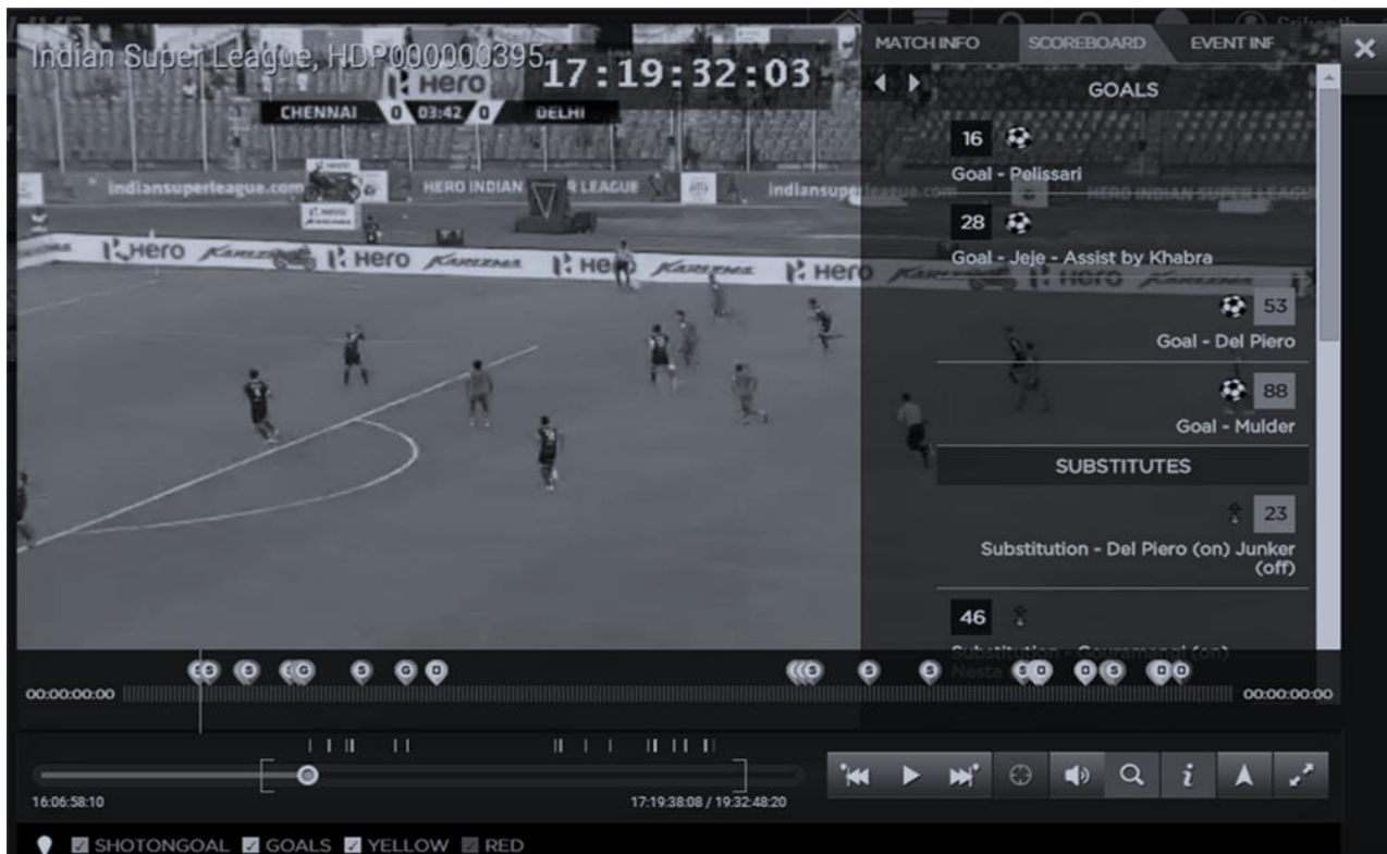
Figure 2 – Smart Player – Marriage of Data & Video