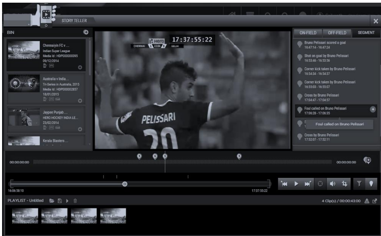
Figure 3 – StoryTeller – Creating engaging stories on the fly