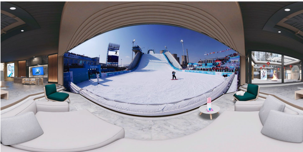
Figure 4 – VR Headset App Experience

During events and replays, users could choose between the 360 and 180 feeds. The VR180 feed was presented in an attractive virtual suite, decorated with Olympics posters, graphics and gadgets. The suite had a large virtual window, which made the user feel like they were looking out to the action, and often – depending on camera position – they were very close to it. In ice hockey, for instance, two cameras were positioned against the glass wall behind each goal, and players would often bodycheck into that wall and seemingly into the user. Many viewers will have jumped back in their seats when that happened – that’s how real it felt. The virtual suite was designed such that it covered the edges of the video on all four sides, enhancing the sense of presence. Figure 4 gives an impression of the environment; users only see a small part of this in their headset – about 12% of the full ERP.