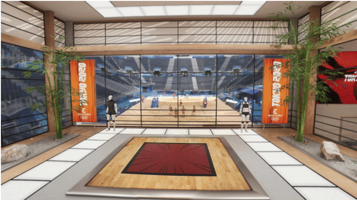
Figure 2 - Studio Backdrop using an Immersive Camera as used for Tokyo 2020